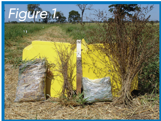
LEFT —Treated with herbicides

An investment in a proper herbicide treatment is the single best input for increasing forage grass production.