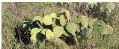
Tordon® 22K herbicide @ 32 oz/A