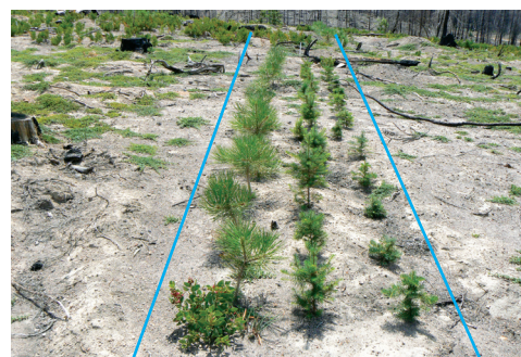
Squaw carpet control with Cleantraxx™ at 3 pints/acre applied pre-emergence in spring 2013 (Photo taken approximately one year after treatment)