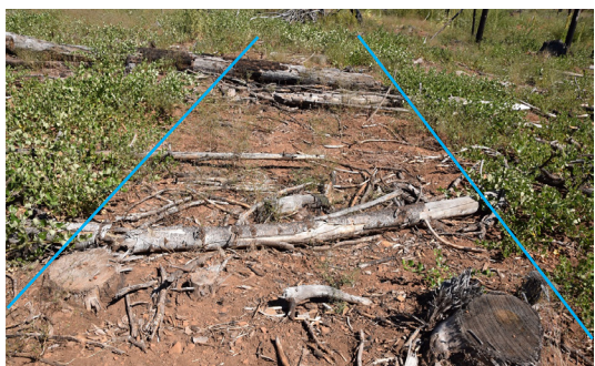
Snowbrush Ceanothus seedling control approximately 2 years after fall application with Cleantraxx™ + Milestone® at 3 pt + 7 fl oz/acre applied October, 2014 (photo taken August, 2016)