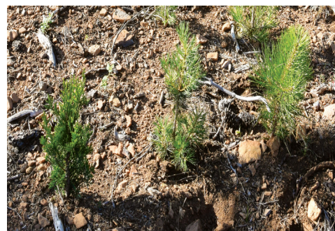
Incense cedar, sugar pine, and Ponderosa pine at 1 year after treatment with Cleantraxx™ at 3 pints/acre + non-ionic surfactant at 0.25% v/v applied post bud break (2-3 inches of new growth on May 16, 2014). No herbicide symptoms observed, trees growing normally

For more information about Dow AgroSciences or any of our Industrial Management products, visit VegetationMgmt.com