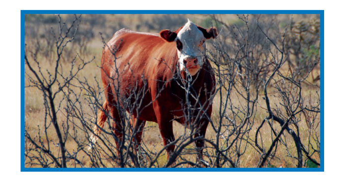
Treatment of top growth without rootkill leads to thick, multiple-stem growth from buds on the underground crown.